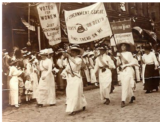
Women marching for the right to vote in the United States.