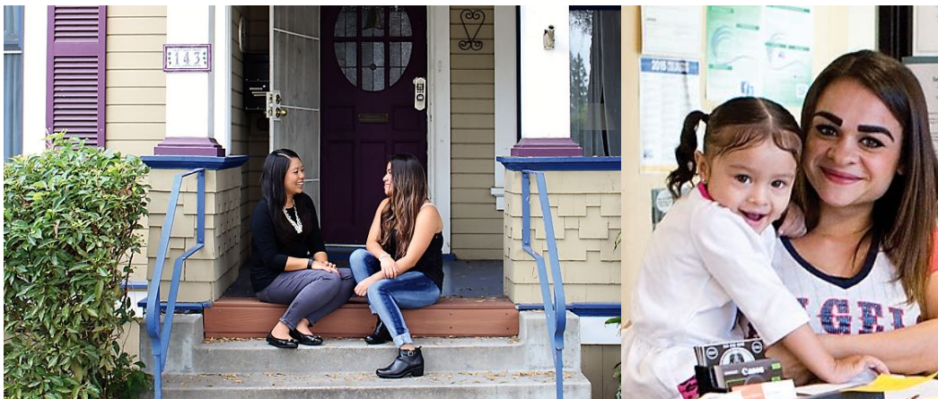
Orangewood Foundation - Helping young women and girls (and their children).